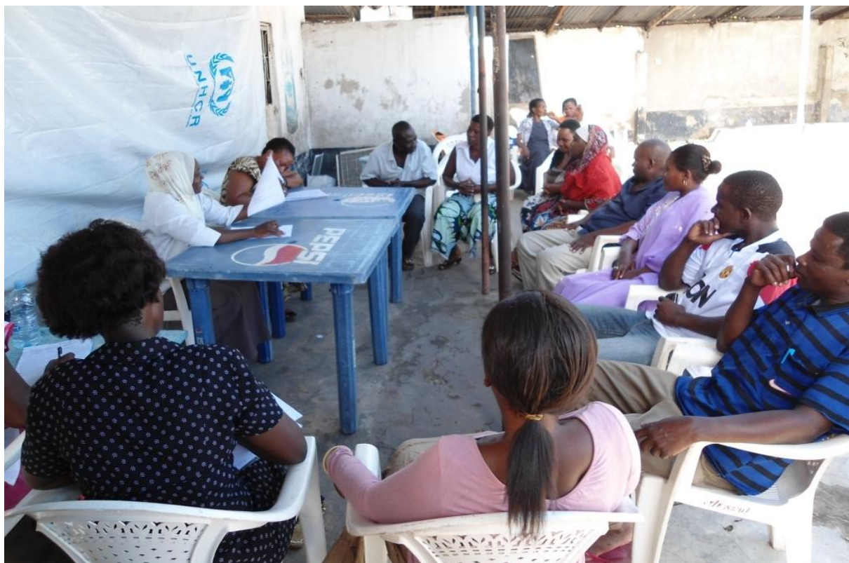
Community members participating in a focus group discussion at Keko Machungwa settlement during the situational analysis study. Shame Juma, 2012.

The processes of profiling, mapping and enumeration included feedback meetings with the communities. Data gathered was shared and community participants were encouraged to respond to the findings and propose solutions to identified problems. The direct engagement of community members in the collection and analysis of data helped communicate the findings to other residents and strengthen the presentation of the results to the local authorities.