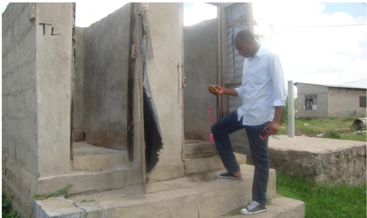
Community member taking GPS coordinates during the sanitation mapping exercise at Kombo settlement.

In its second year this action research project will demonstrate new sanitation precedents. These precedents will exemplify models of sanitation provision that are affordable to low-income households and which have the potential to address the scale of need through replication across the city. The collaboration with local government is intended to maximise the likelihood of leveraging financial resources and the political commitment required for policy and regulatory reform. A partnership between government and organized communities of the urban poor is central in this strategy and the co-production of affordable sanitation solutions is likely to be the most effective way to secure city-wide improvements.