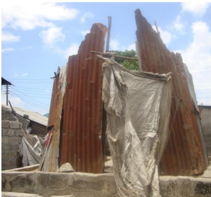
A poorly constructed pit latrine at Kombo settlement. M.Mkanga 2012.

Community mapping towards inclusive development